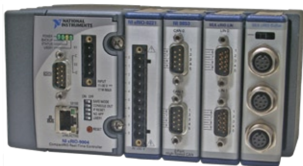
CompactRIO system with S.E.A. LIN and EnDat module and NI CAN and IO module.